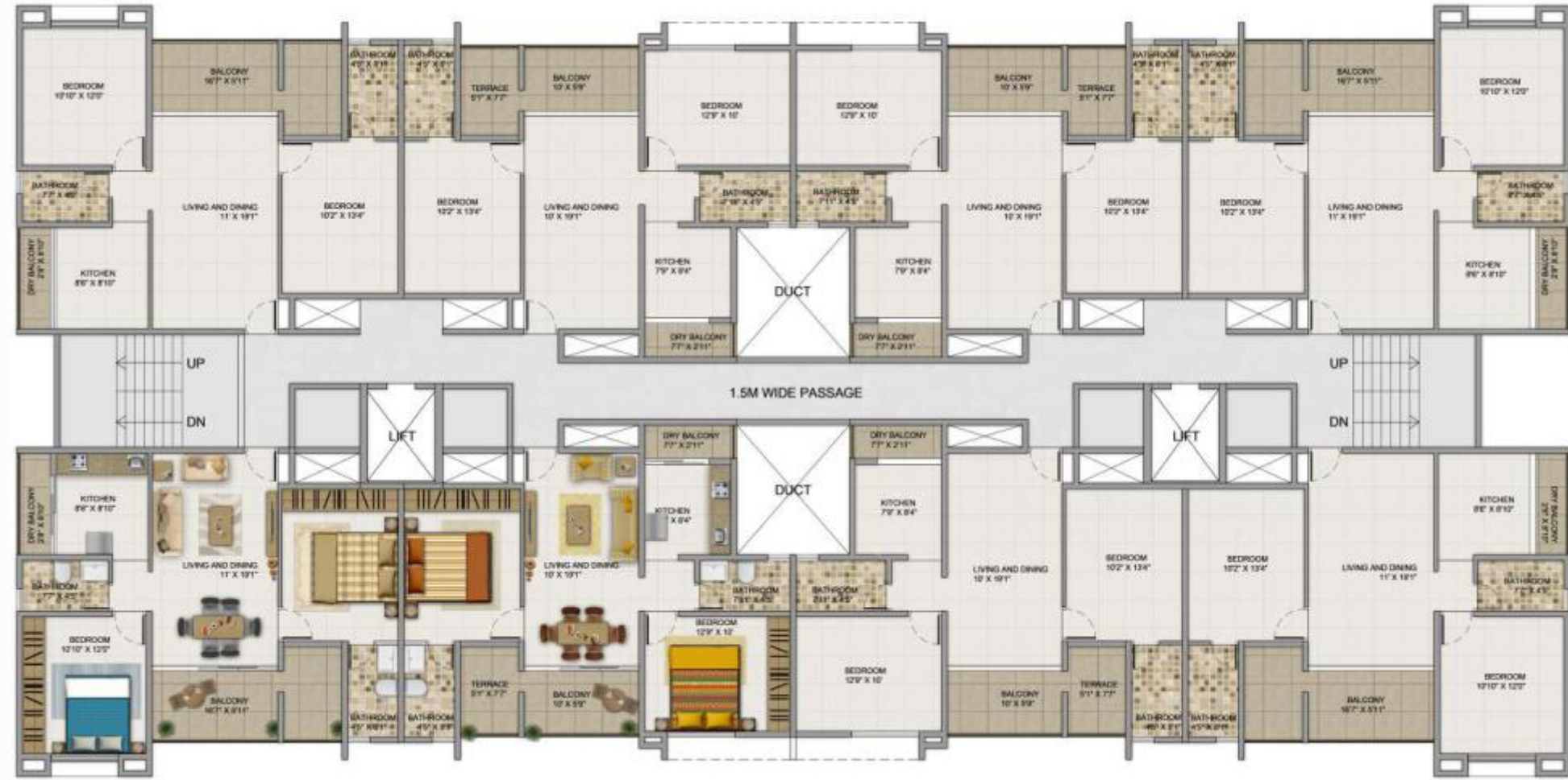
EVEN FLOOR PLAN